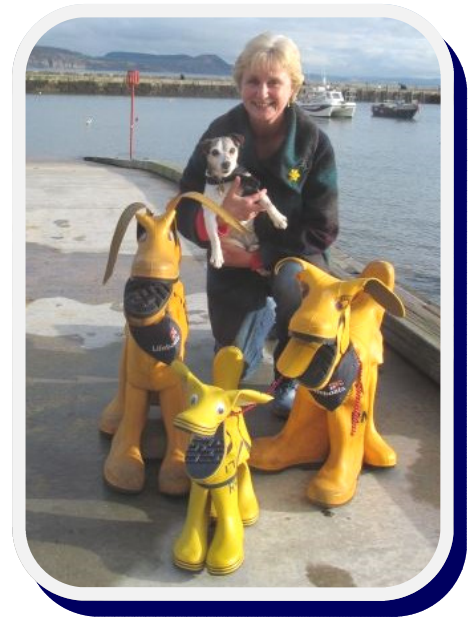
Our Wellie Family are very popular

£66,806 for the life-saving charity during 2018, including £35,152 during Lifeboat Week. He said: "It has been an extremely good year, and all down to our volunteers." The meeting heard that takings at the lifeboat shop on the Cobb totalled £138,203 and it had been the best performing RNLI shop not attached to a museum or visitor experience centre.